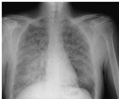
Figure 1 Chest radiograph.

Arterial blood gas analysis on air (table 1) demonstrated the patient was