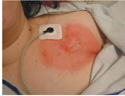
Figure 3 "Rash" over the pacemaker site.

The patient was readmitted in one week for severe bradycardia and syncope. At that time it was decided to place a permanent pacemaker secondary to persistence of symptomatic bradycardia. After the pacemaker placement the patient's symptoms seemed to improve dramatically. On the follow up visit to the clinic a purplish rash was noted over the pacemaker site (fig 3). She also began to complain of recurrent symptoms of postural dizziness. Suspecting a