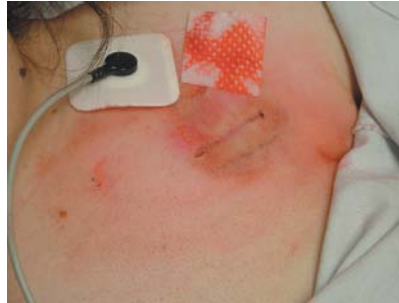
Figure 4 "Rash" over the pacemaker site wiped off with an alcohol swab.

pacemaker infection the patient was readmitted to hospital. During her hospital stay, a closer examination of the rash showed that it could be wiped away by an alcohol swab and the colour