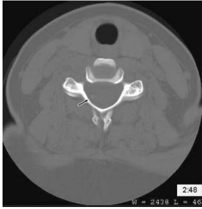
Figure 2 Computed tomography showing a tube (arrow) used for decompression of syrinx in the cervical cord.

She was prescribed fludrocortisone for presumed autonomic dysfunction and discharged and was scheduled for follow up in one month.