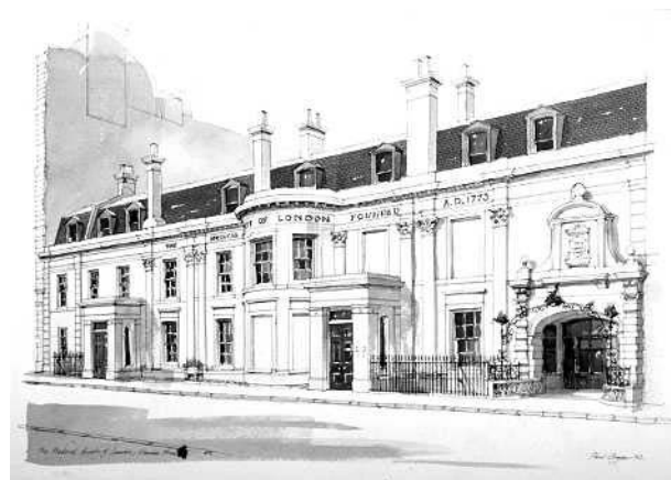
Figure 4 The Society’s house at 11 Chandos Street. A watercolour by Paul Draper, 1992.

At least a dozen medical societies were founded in London during the late 18th century; only four survived to 1810. They were replaced by new societies, notably the Hunterian Society (1819) and the Harveian Society of London (1831), and by the 1880s the capital was saturated with specialist medical societies. Many of these were swallowed up by the Royal Society of Medicine in 1907 and in 2004 only a handful of independent medical societies remain active. The Medical Society of London, now in its 231st session, is the oldest and most prosperous. Its role has expanded in line with the liberal principles of its founders; members are drawn from different disciplines and meetings covering a wide range of subjects are conducted in a congenial atmosphere. At Lettson House the library, archives, paintings, and memorabilia are treasured and additions to the collections are acquired regularly. Not only is Lettson House the Society’s much-loved home, it also functions as the headquarters of other societies in the firmament. Here Presidents of Royal Colleges, Masters of livery companies, generals, admirals, professors, general practitioners, and specialists congregate to confer, socialise, and learn from one other, as Lettson had intended.