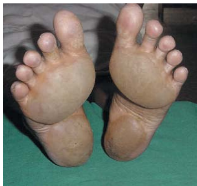
Figure 1 Soles of patient showing tense bullae.

A 62 year old woman, who had type 2 diabetes of 15 years' duration, developed community acquired pneumonia. Her sensorium was normal. Skin examination revealed bilateral tense painless bullae on her soles and toes (fig 1). She had peripheral sensory motor neuropathy. Bullae aspiration revealed clear fluid. Immunofluorescent studies and fluid cultures were negative. The bullae healed over two weeks.