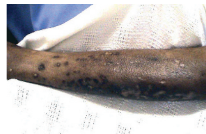
Figure 2 Skin examination of his right leg demonstrated multiple scars from subcutaneous drug injections with track marks and skin popping lesions.