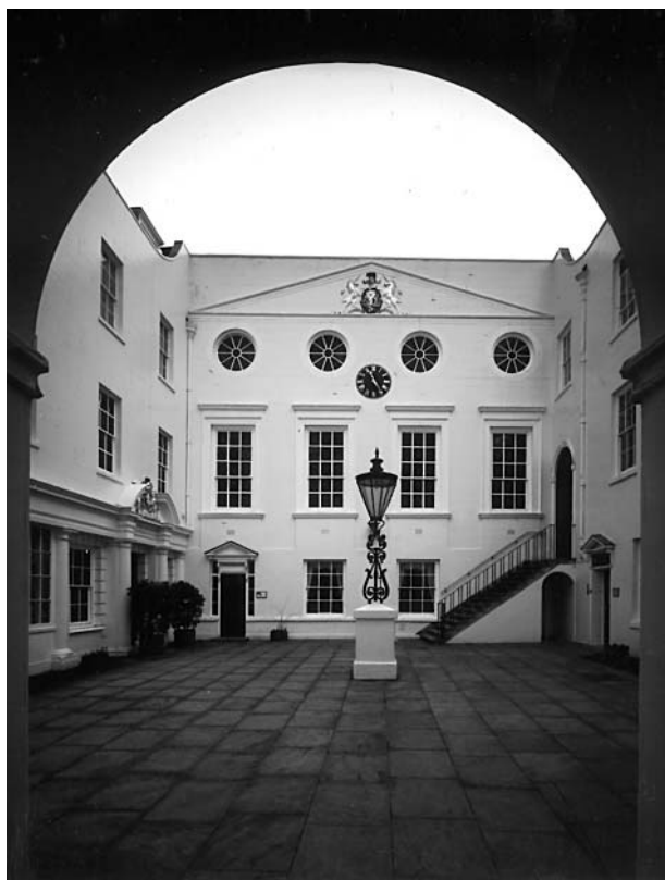
Figure 3 The courtyard of Apothecaries' Hall, Black Friars Lane, London.

The Society continued to examine Dispensers until 1998 and from 1928 to 1963 it awarded the first postgraduate diplomas in midwifery (the MMSA—Mastery of Midwifery of the Society of Apothecaries). It administered examinations for biophysical assistants in electrotherapeutics (the BPASA), and as the 20th century wore on diplomas were established in industrial health, medical jurisprudence, genitourinary medicine, sports medicine, regulatory toxicology, musculoskeletal medicine, the medical care of catastrophes, and clinical pharmacology. Ultimately, the Mastery of Midwifery led to