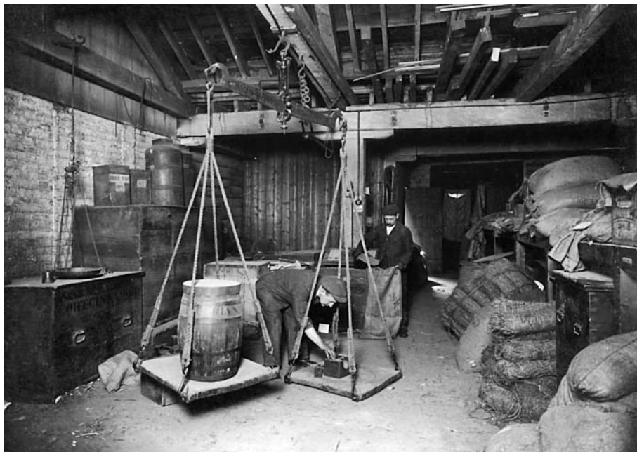
Figure 2 The manufacture of drugs and medicines at Apothecaries' Hall was a major activity until the closure of the trade in 1922.

Black Friars Lane and Playhouse Yard were given their sturdy, industrial appearance, whereas the Society's Hall preserves the character of a late 17th century town house.