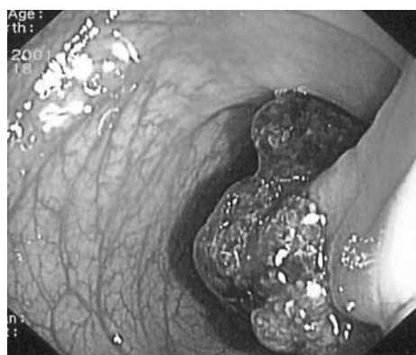
Figure 1 Colonoscopy shows the polyp lesion at the level of the sigmoid colon.

We describe a successful intraoperative detection of a polyp in a 40 year old woman with high resolution ultrasonography using a flexible tip ultrasound probe coupled with colour power Doppler followed by radical laparoscopic removal of the lesion.