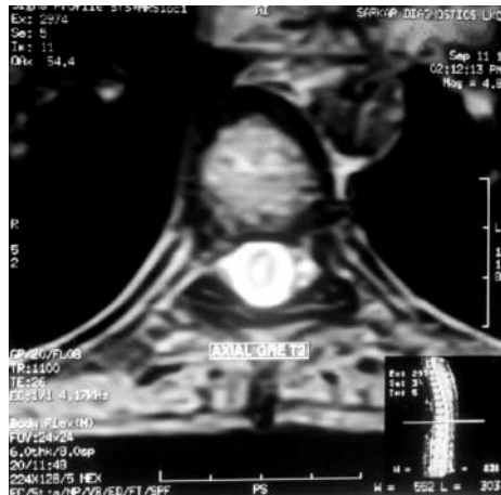
Figure 3 Axial T2-weighted MR image of thoracic spinal cord showing a centrally located hyperintense signal in a patient with ADEM having transverse myelopathy.

been described. MRI features described in patients with demyelinating disorders can also be seen in antiphospholipid syndrome. A clear distinction between an acute demyelinating disorder like ADEM and antiphospholipid syndrome can be difficult. Cuadrado et al in a recent article, suggested that a careful medical history, a previous history of thrombosis and/or fetal loss, an abnormal localisation of lesion on MRI, and the response to anticoagulant therapy might be helpful in the differential diagnosis of these two different diseases. 46