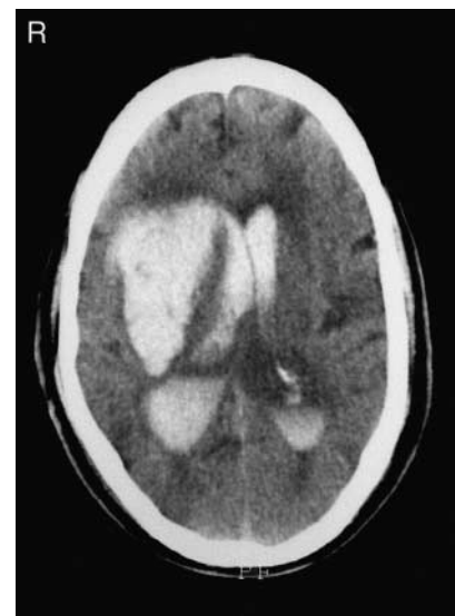
Figure 1 Computed tomogram of head.

He was immediately intubated and ventilated by an anaesthetist. His arterial blood gases showed type I respiratory