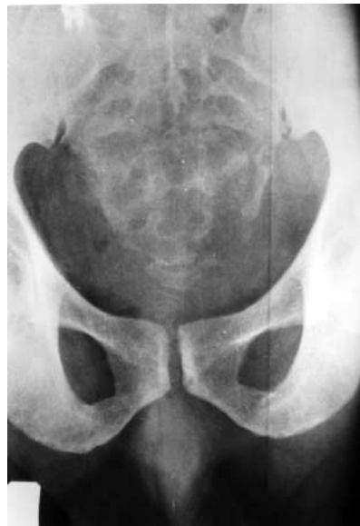
Figure 1 Anteroposterior radiograph of sacrum.