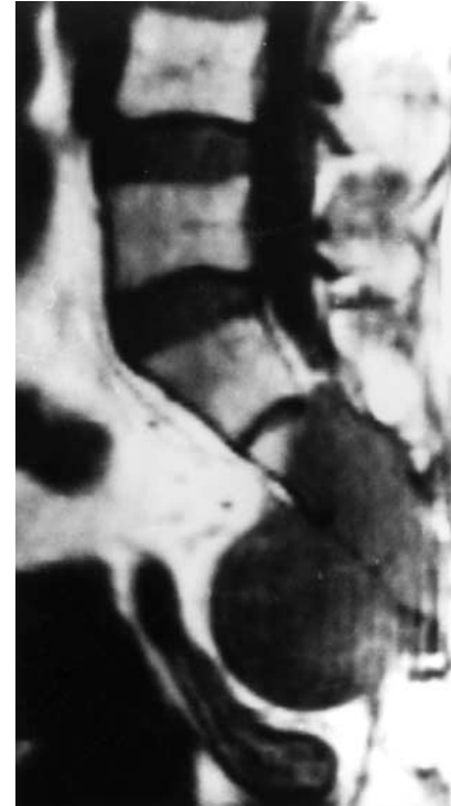
Figure 2 MRI scan of sacrum.