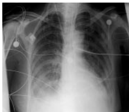
Figure 1 Portable anteroposterior chest radiograph with bilateral interstitial infiltrates and effusions.

On the fourth evening she developed a temperature of 38.9°C and a transient maculopapular, pruritic, pink rash. Over the next few days she became progressively dyspnoeic with a room air arterial blood gas revealing a pH of 7.49, carbon dioxide pressure of 3.73 kPa, and oxygen pressure of 526.93 kPa. A repeat radiograph (fig 1) showed diffuse bilateral infiltrates and small pleural effusions. Computed tomography of