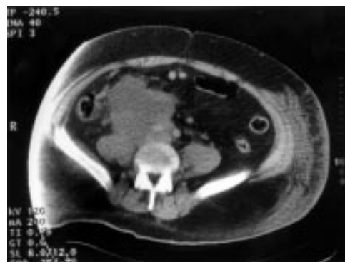
Figure 1 Contrast enhanced computed tomography immediately caudal to the aortic bifurcation.

Vena caval invasion is a well recognised but relatively rare complication of testicular tumours. Vena caval invasion more frequently occurs with right sided tumours, as the sentinel lymph node on this side is usually the intercaval node at the level of the right renal artery. 5 Such patients may present with pulmonary emboli, although thrombus in the vena cava can extend and cause the Budd-Chiari syndrome with hepatorenal failure. The iliac node involvement in this patient is more commonly seen after scrotal surgery. Literature review failed to identify a report of phlegmasia cerulea dolens in testis cancer patients. In our records of more than 300 cases with metastatic testis cancer there are six cases with vena caval invasion and one with Budd-Chiari syndrome. Despite hepatorenal failure that patient responded to low dose chemotherapy similar to that given in this case and proceeded