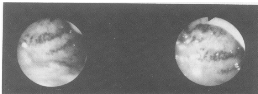
Figure 2 Endoscopic photograph of gastric antrum showing longitudinal folds of dilated vessels radiating from the pylorus. Case 4.

A 42 year old woman, who had a history of primary biliary cirrhosis (PBC) was admitted for investigation of iron deficiency anaemia (haemoglobin 5.8 g/dl). Her faeces were persistently positive for occult blood. Initial endoscopy showed oesophageal varices and 'antral gastritis'. At repeat endoscopy the mucosal appearances were recognized to have typical features of antral vascular ectasia, confirmed by biopsy. The varices were injected until virtual obliteration. However, she continued to require blood transfusions of 3–4 units every