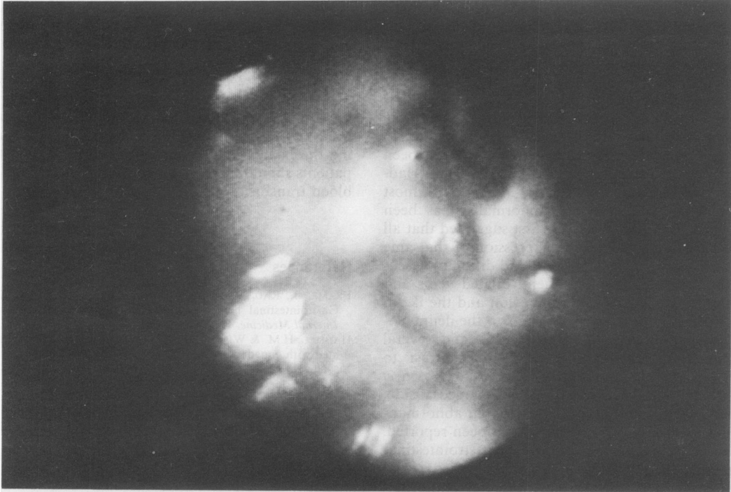
FIG. 1. Endoscopic view of tortuous varix-like vein in the terminal ileum (diameter about 7 mm) in a patient with Turner's syndrome. (Endoscope: Olympus CF IBW, videocamera: ITC Ikegami, Tsushinki Co. Ltd., Japan.)