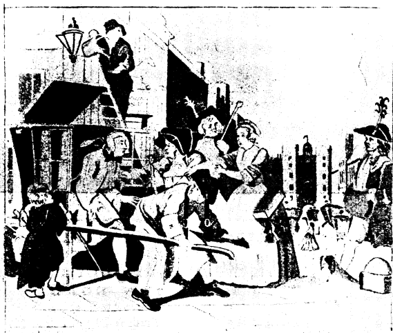
WILLIAM HOGARTH, 1697-1764.

53, Short's Gardens, Drury Lane, London, W.C. 2.