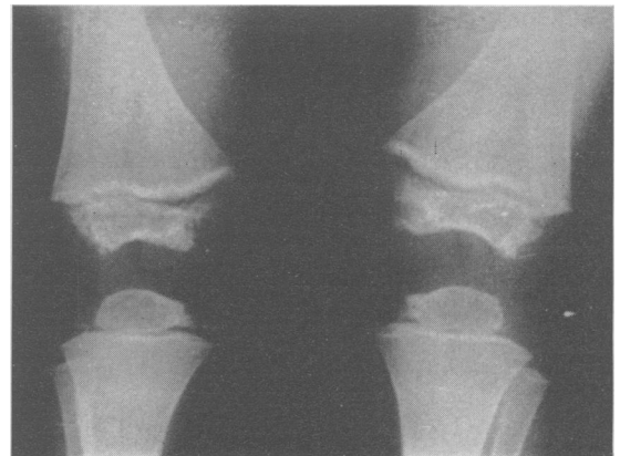
FIG. 2. Lower femoral epiphysis showing dysgenesis.

Subsequent course. The patient was given iron dextran injections because of the iron deficiency anaemia. Thyroid replacements were not given at this stage. The vaginal bleeding stopped 4 days after admission. The girl was then kept under observation. Fifteen days after admission vaginal bleeding recurred. This time the blood loss was small and lasted only 2 days. Cytological examination of a scraping from the vaginal mucosa 7 days after this episode showed basal cells 0, intermediate cells 99% and cornified cells 1%. Two months later the patient