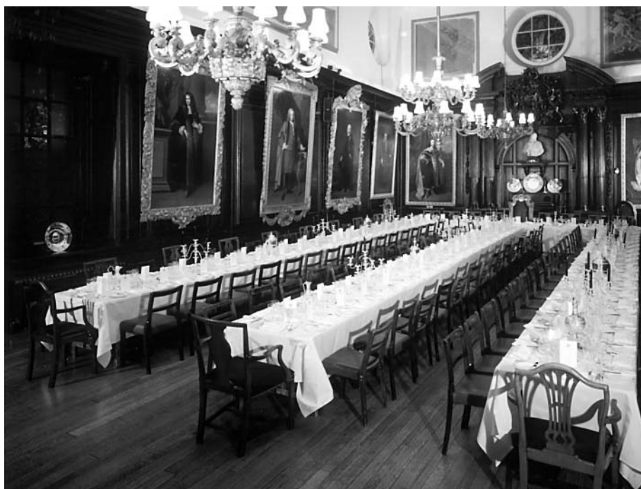
Figure 4 The Great Hall is hung with portraits of King Charles I, King James I, Masters, benefactors, and members of the Society. The marble bust of de Laune by John Young (1676) surveys the scene from the far end.

the founding of the Royal College of Obstetrics and Gynaecology; the Diploma in Industrial Health prompted the formation of the Institute of Occupational Medicine; and several other medical specialties pioneered by the Society of Apothecaries have achieved wider acclaim as Faculties or Sections of the Royal Society of Medicine.